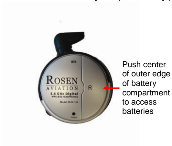
Figure 2 Right earpiece