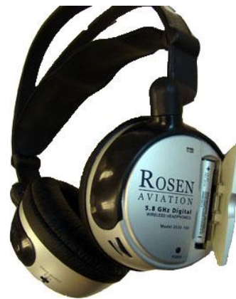
Figure 3 Open battery compartment

Note: Never leave batteries inside the headphones for long periods of time to prevent damage to the headphones from leaking batteries.