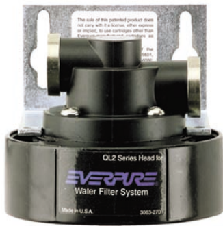
QL2 Single Head: EV9272-19 (12 pack)

Filter head exclusively for Everpure replacement cartridges